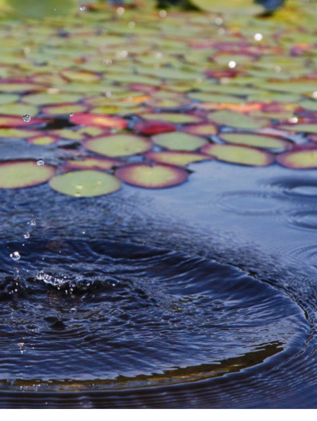
WATER GOVERNANCE ANNUAL REPORT