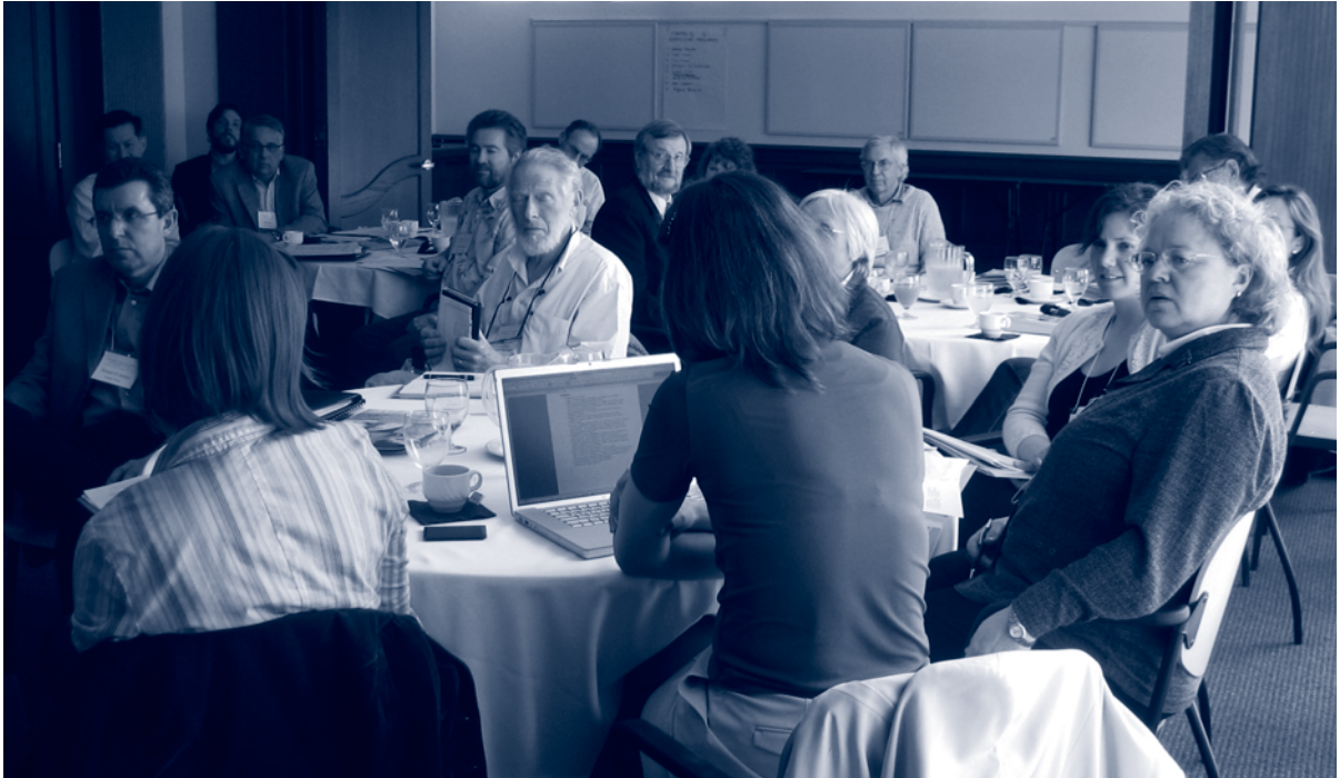
Sustainable Water Infrastructure Management in Canada Workshop - May 2008