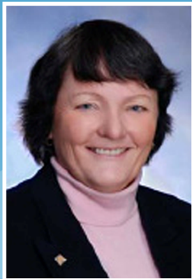
Dr. Judy Isaac-Renton Public Health Laboratory at the BC Centre for Disease Control