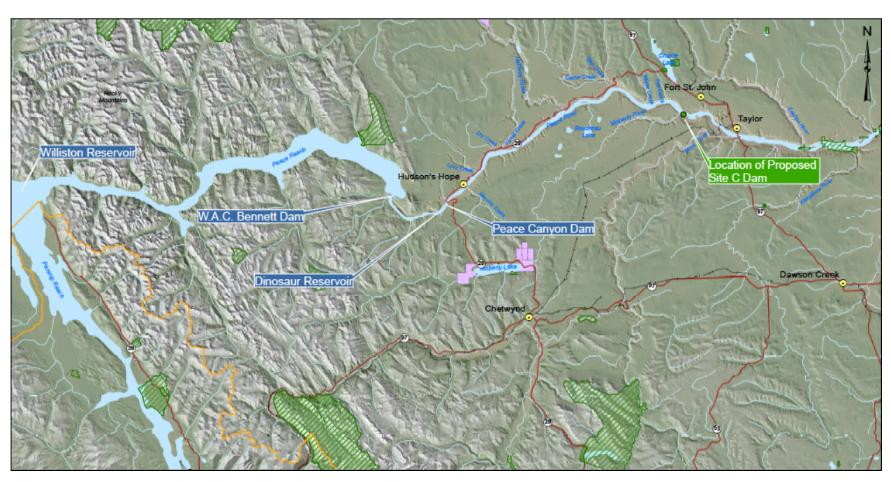
Figure 3.1 Hydroelectric developments on the Peace River<sup>1</sup>

The result of the Two Rivers Policy was the development on the Peace River of the GM Shrum Generating Station in 1968 (2730 MW) and the Peace Canyon Generating Station in 1980 (694 MW), and the creation of a large electricity surplus that powered industrial growth, served growing demand in the lower mainland, and provided revenues from exports.